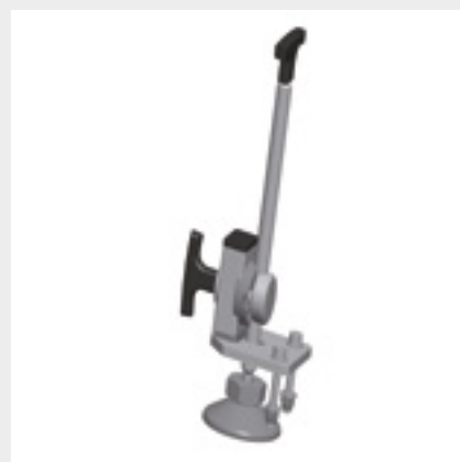
10.421 Locking stabilizer for closed unit