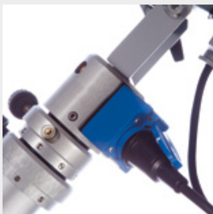
BP.3400 Schuko socket and plug