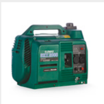
10.412 2KVA Silenced Generator